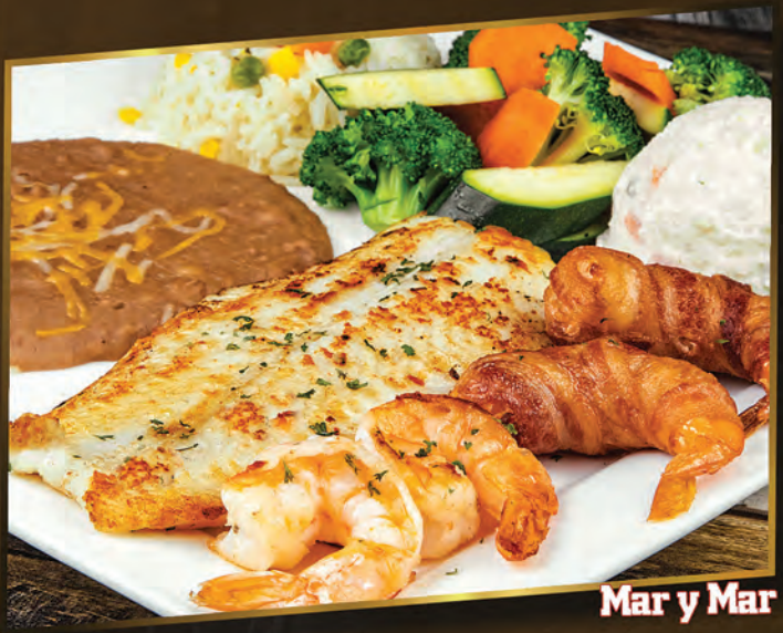
Mar y Mar

Seasoned, sautéed shrimp served with steamed vegetables, rice & seasoned potatoes. $22.99