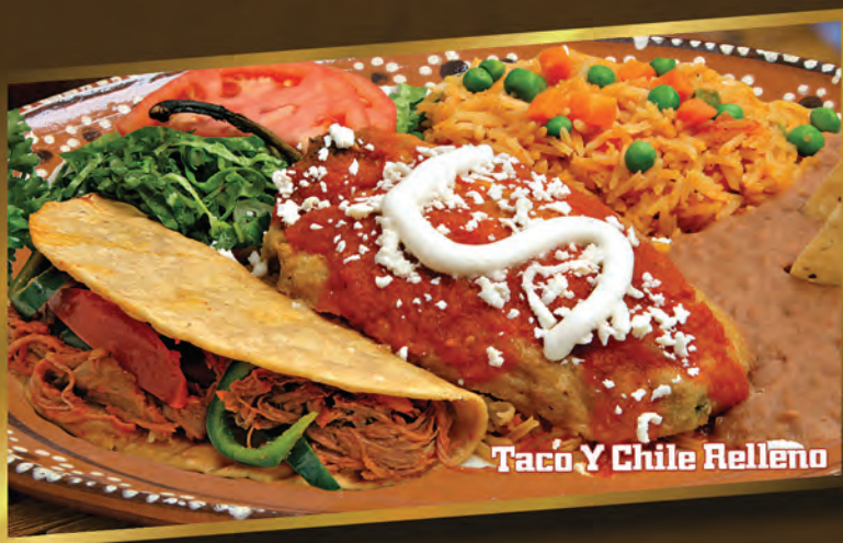
Taco Y Chile Relleno