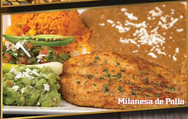
Milanesa de Pollo