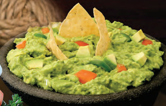
Fresh Guacamole MP Made to order