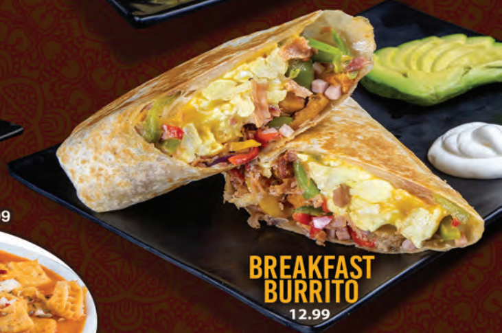
BREAKFAST BURRITO 12.99