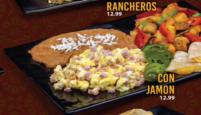
CON JAMON 12.99