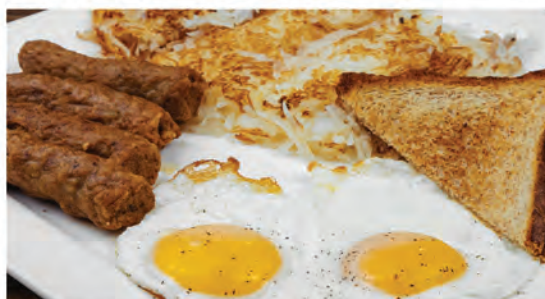
SAUSAGE & EGGS Sausage and eggs served with hashbrown and toast. 12.99