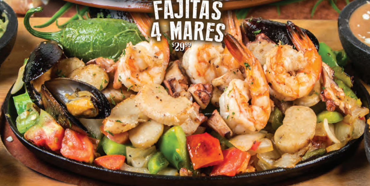
FAJITAS 4 MARES $29.99

Indulge your taste buds with a mix of Shrimp, Octopus, Type Abalone, Mussels, Crab legs mixed with a spicy House Sauce served on a tropical Pineapple