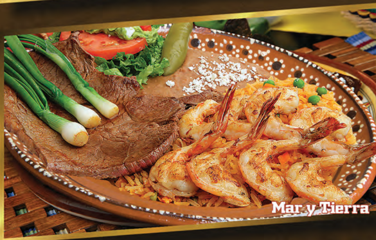
Mar y Tierra