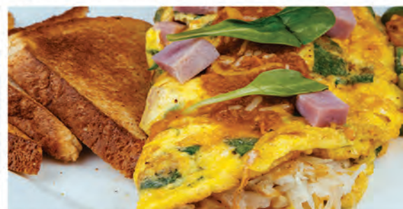
HAM & SPINACH OMELETTE Ham, spinach and hashbrown omelette topped with our special salsa and cheese. Served with country potatoes and toast. 14.99

CHILAQUILES Tortilla chips with scrambled eggs, marinated in a special salsa, topped w/ melted cheese & sour cream. 13.99