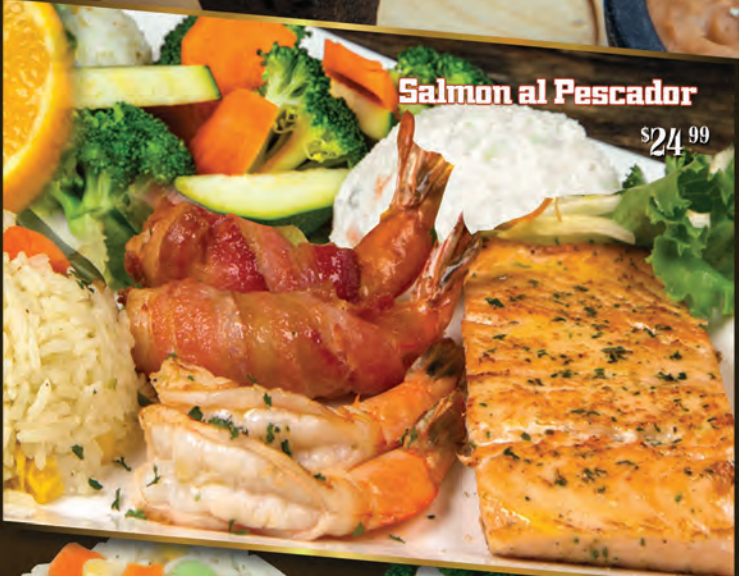
Salmon al Pescador $24.99