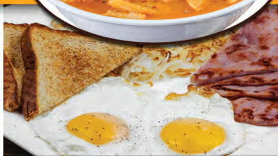
HAM & EGGS Ham and eggs served with hashbrown and toast. 12.99