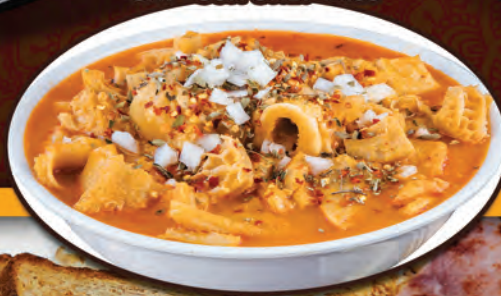
MENUDO SAT - SUN ONLY 14.99