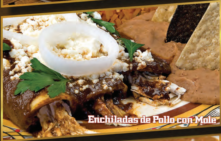
Enchiladas de Pollo con Mole