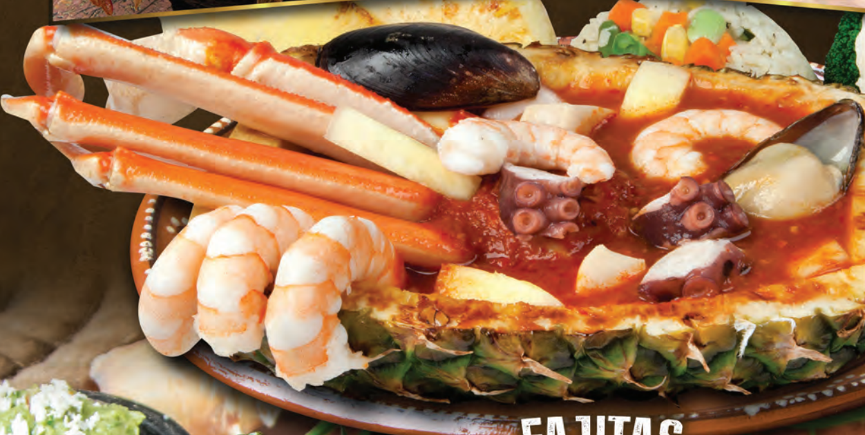
PIÑA EL PESCADOR $31.99

Indulge your taste buds with a mix of Shrimp, Octopus, Type Abalone, Mussels, Crab legs mixed with a spicy House Sauce served on a tropical Pineapple