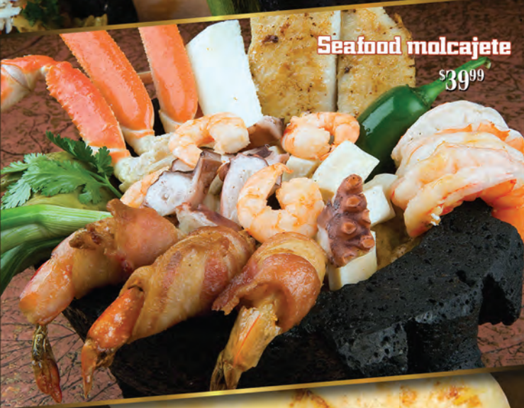
Seafood molcajete $39.99