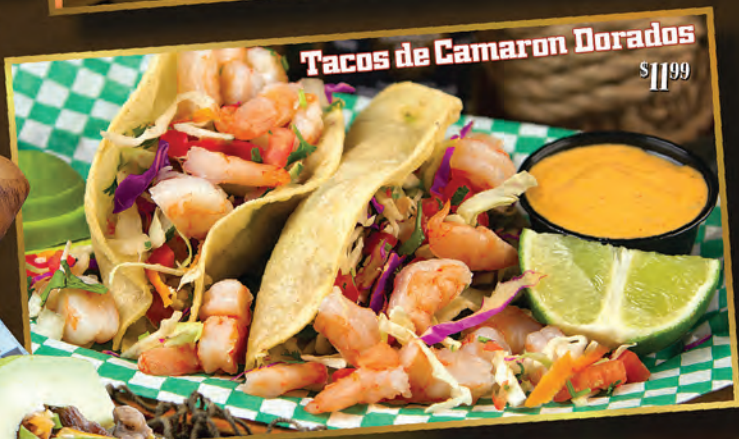
Tacos de Camaron Dorados