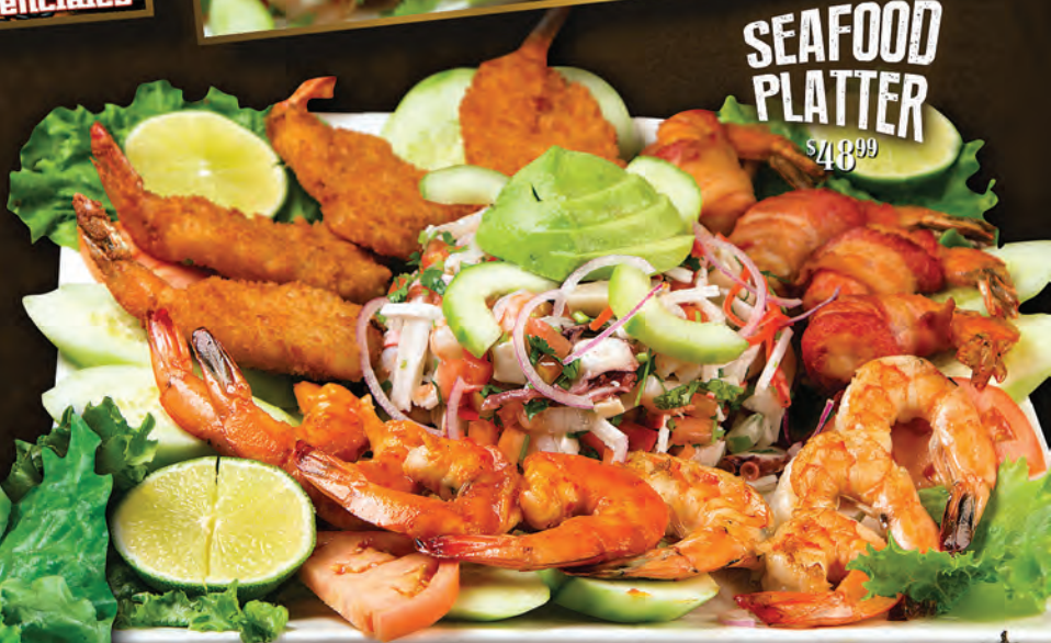
SEAFOOD PLATTER $48.99

WARNING EATING RAW OYSTERS MAY CAUSE SEVERE ILLNESS AND EVEN DEATH IN PERSONS WHO HAVE LIVER DISEASE SUCH AS ALCOHOL CIRRHOSIS, CANCER OR OTHER CHRONIC ILLNESS THAT WEAKENS THE IMMUNE SYSTEM. IF YOU EAT OYSTERS AND BECOME ILL YOU SHOULD SEEK IMMEDIATE ATTENTION. IF YOU ARE UNSURE IF YOU ARE AT RISK, YOU SHOULD CONSULT YOUR PHYSICIAN.