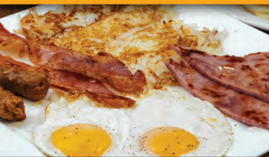
BREAKFAST SAMPLER Eggs, sausage, bacon and ham served with hashbrown and pancakes. 13.99