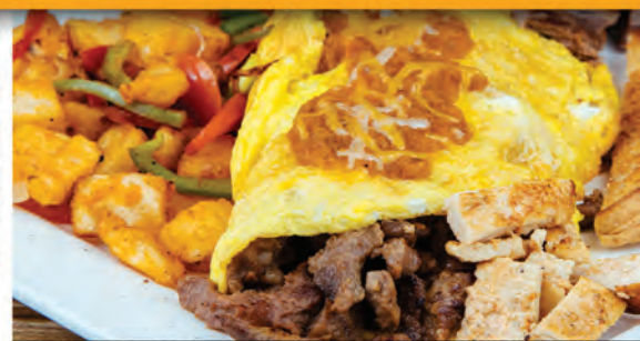
SUPREME OMELETTE Chicken & steak omelette topped with our special salsa & melted cheese. Served with country potatoes and toast. 14.99