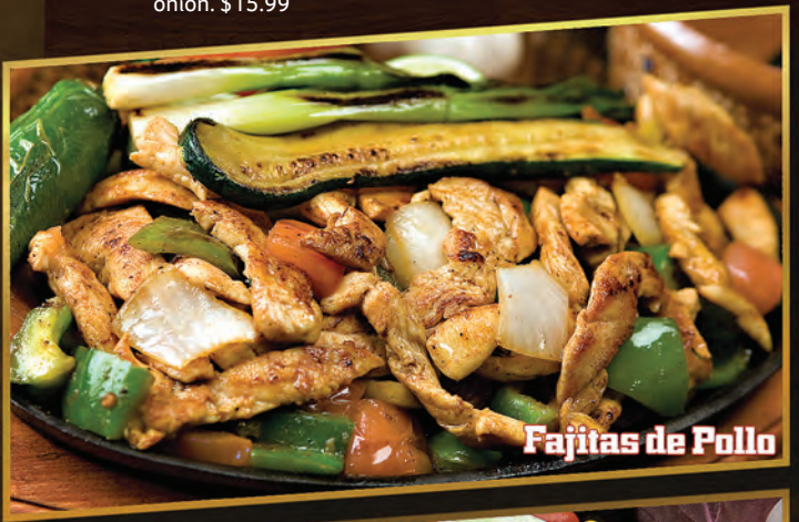
Fajitas de Pollo