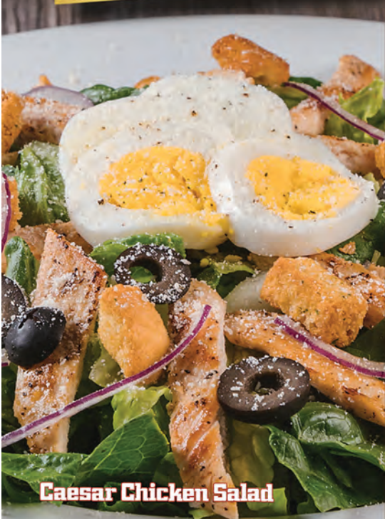
Caesar Chicken Salad