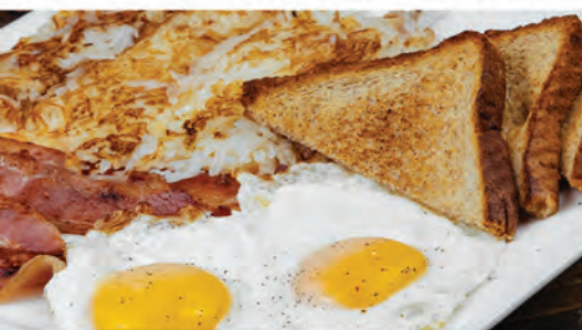
BACON & EGGS Bacon and eggs served with hashbrown and toast. 12.99