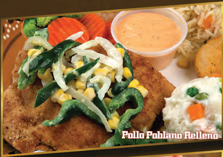
Pollo Poblano Relleno