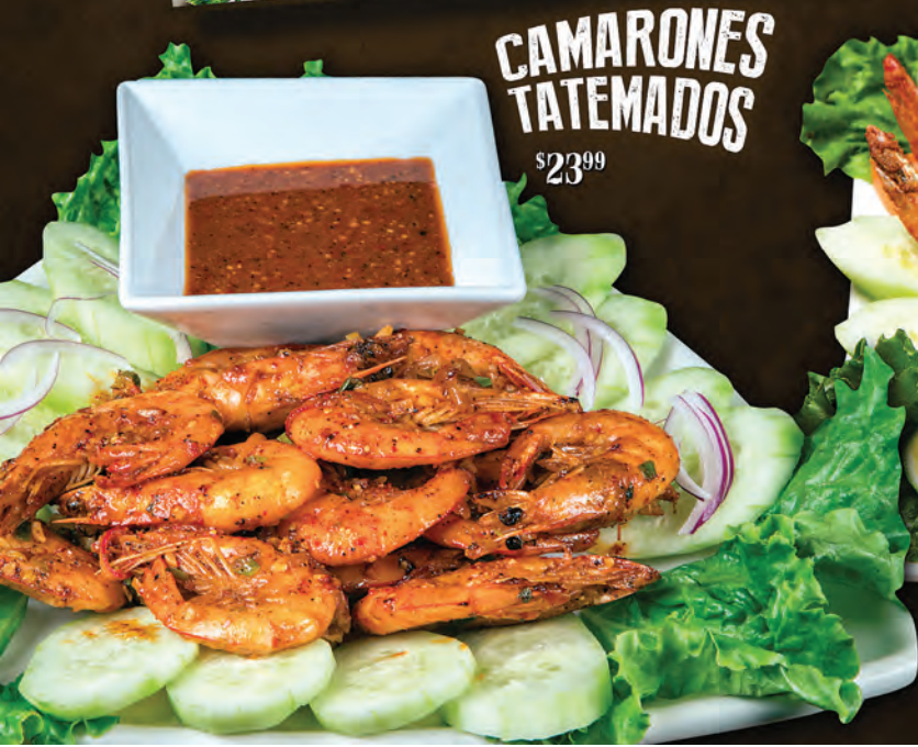
CAMARONES TATEMADOS $23.99