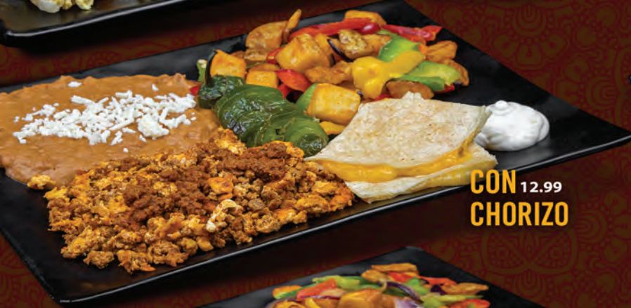
CON CHORIZO 12.99