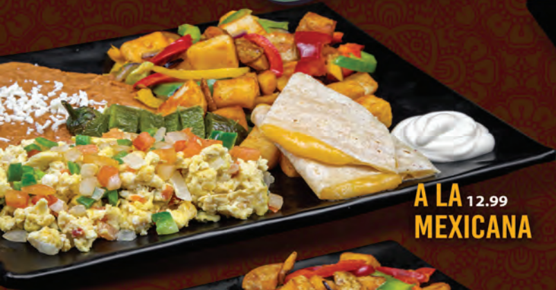
A LA MEXICANA 12.99